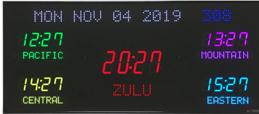
Model 6614E - 4.0" center zone time & 2.0" zone labels, 2.5" perimeter zone time & 1.2" zone labels, 2.0" 20 character date, 5 zones